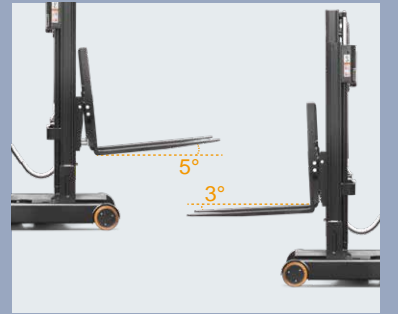
Fork tilt F/R: 3° / 5°